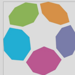
TRAINING COMPANY OF THE YEAR