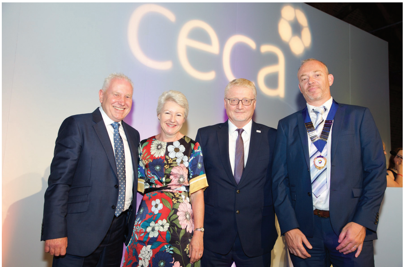
The CECA Southern Team