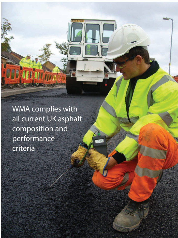
WMA complies with all current UK asphalt composition and performance criteria

Nevertheless, there are many sites across both the Strategic Road Network (SRN) – managed by Highways England and on the local road network where WMA has been trialled and used successfully. Some authorities routinely specify the material and Highways England will allow its use subject to successful departure from standard application and approval.