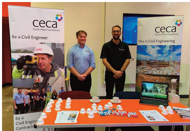
Plymouth University's Annual CivSoc Careers Fair