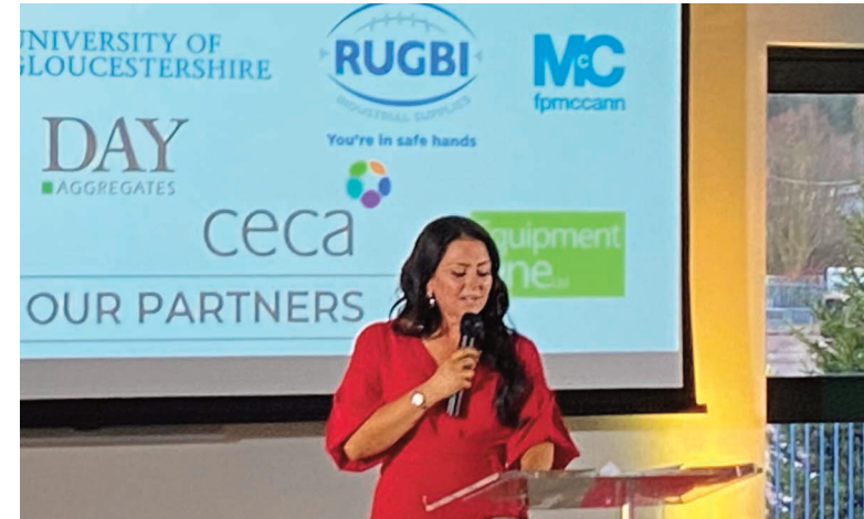
AccXel launch event in November 2021