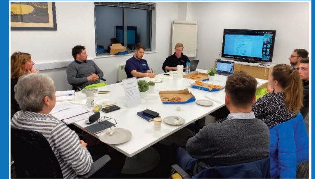
Group meeting at CECA's Exeter Office