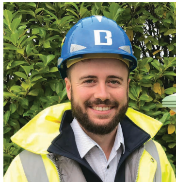
Greg Crowe Bridge