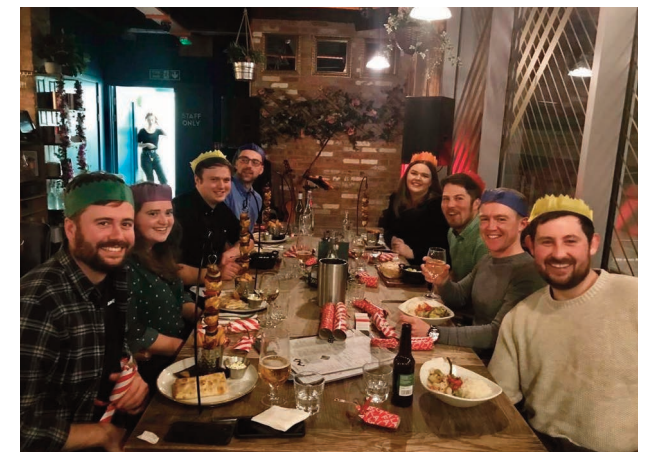
Christmas Party 2021