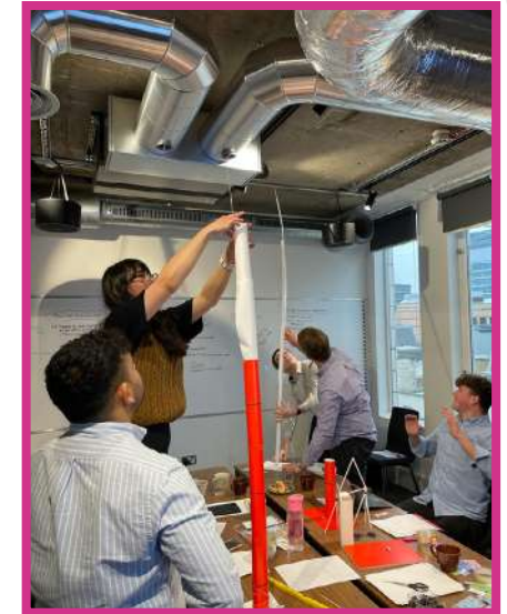
Above: CECA Material Workshop Trial. Below: Orchards Academy Visit, March 2022