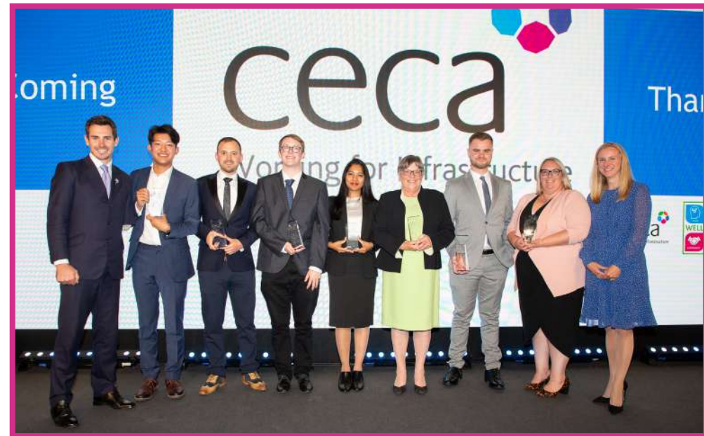
Above: Winners of the CECA Southern 2022 Awards take the stage.

Winners received an inscribed memento and cash prize of £500.