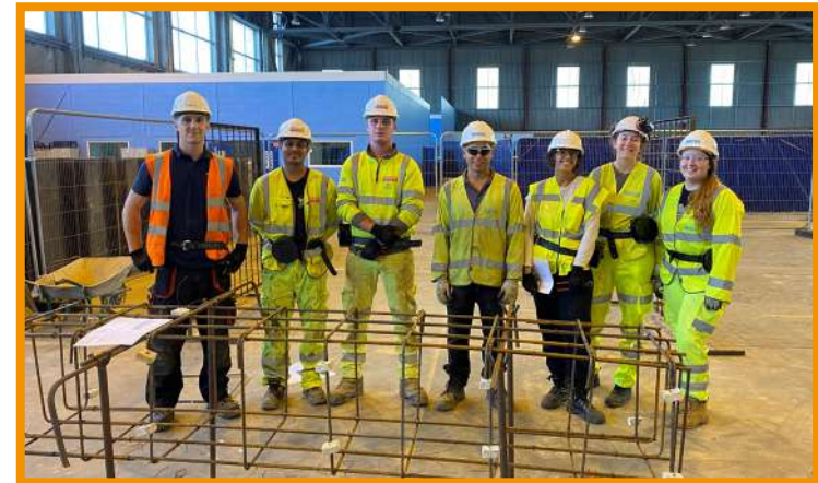
Practical Skills Week cohort at the National Construction College, Bircham Newton, September 2022

"Very interactive with lots of great relevant activities."