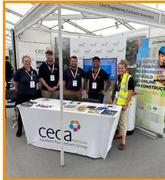
Above: The Group attending Seaworks 2022 in June. Below: CECA NextGen Foundations promotional poster