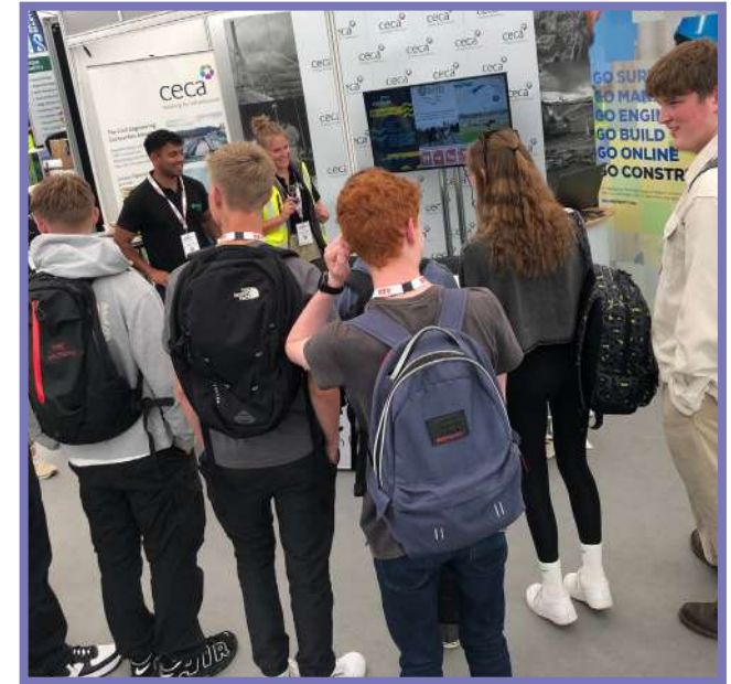
CECA Southern and the NextGen CECA Southern Foundations Group attending the Seaworks Expo June 2022