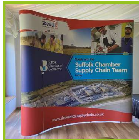
CECA Southern attending the Sizewell C Supply Chain event, April 2022