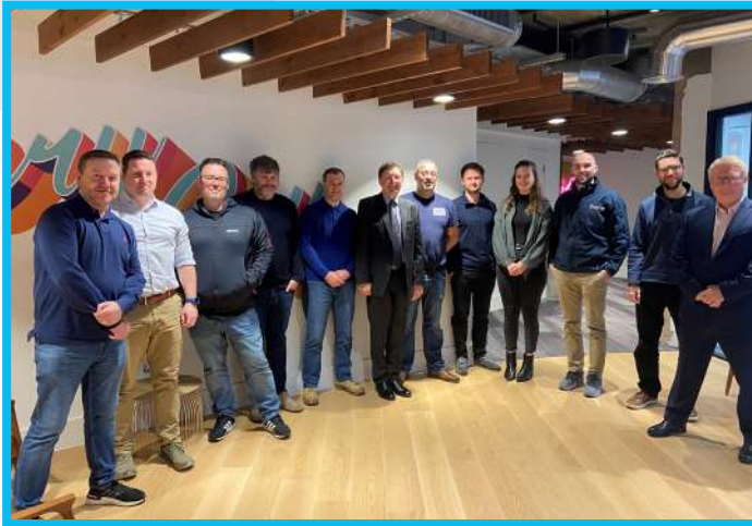
Delegates for the 2022 Management Development Programme