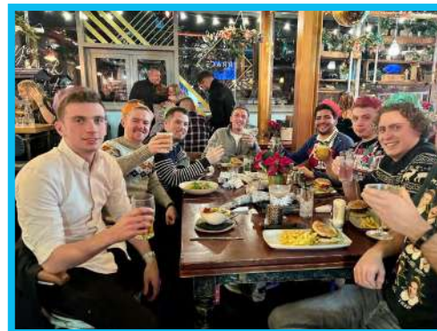
SWFG Christmas Party 2023