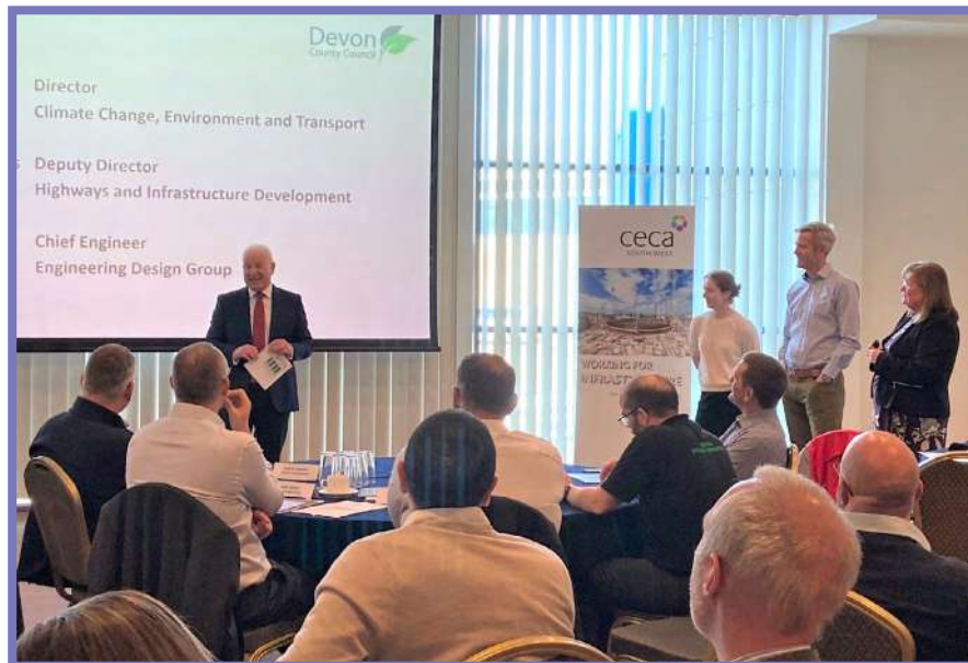
Devon County Council Liaison Meeting with CECA SW Members at Sandy Park

The following pages illustrate the wide range of South West and national clients with whom CECA South West has engaged in 2023.