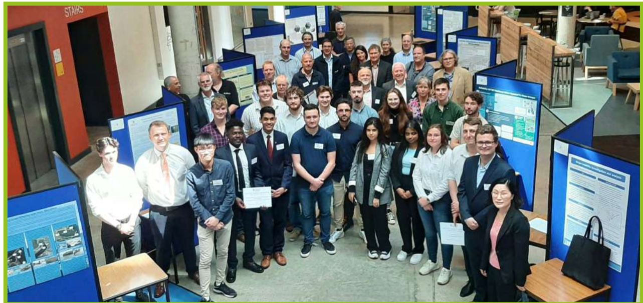
Students presented their work to industry professionals at the Plymouth University Project Showcase event in May