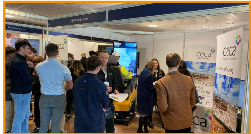
Above: Schoolchildren from the entire SW region attended the National Apprenticeship Show in Exeter in January where the CECA SW Foundations Group hosted a stand