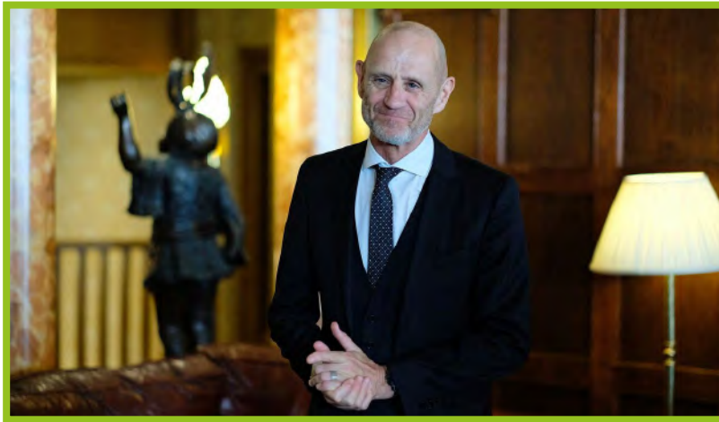
The BBC's Evan Davis was guest speaker. Below right: with a captive audience!

Our Annual Lunch and Young Achievers' Awards 2023 took place in October at the Grand Hotel, Torquay. CECA members were pleased to come together to recognise the fine achievements of young people in our industry and enjoy a stimulating speech by our special guest, BBC news and current affairs presenter, Evan Davis.