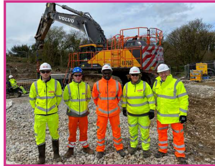
Above: CECA SW Foundations Group visit to Griffiths' site on the St Austell to A30 Link Road in Cornwall