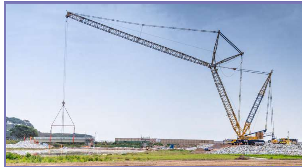
Above: Lowering in the first bridge span on the Lower Otter Restoration Project