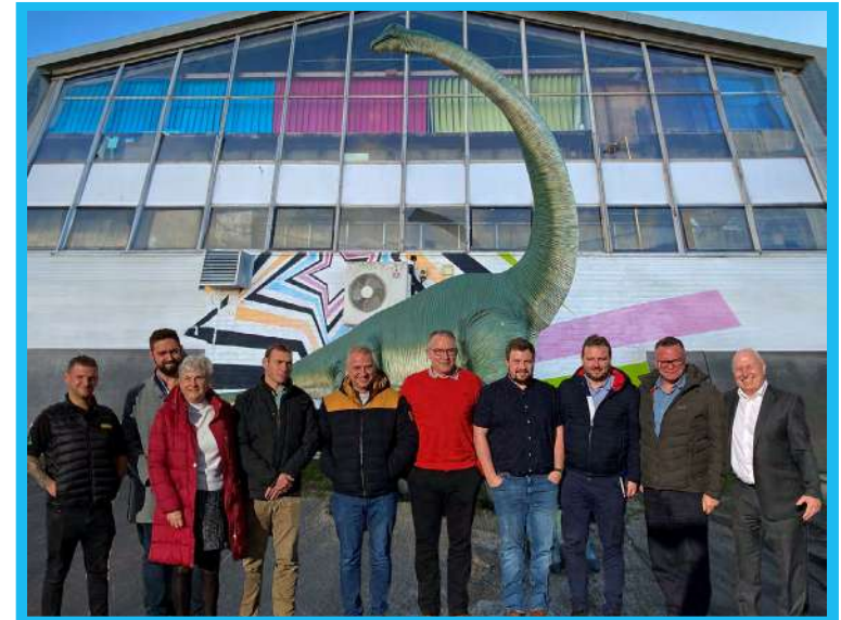
Celebrating the successful completion of the fifth and final digital leadership training session (the big guy with the long neck didn't sign up for the course!)