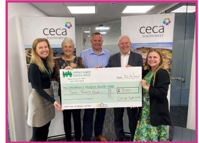
Left: Supported by CECA SW members and their supply chain partners, the 'Lycra Dads' raised over £6,000 from their charity bike ride. Above: a staggering £7,000 was raised at CECA South West's Annual Lunch for Children's Hospice South West