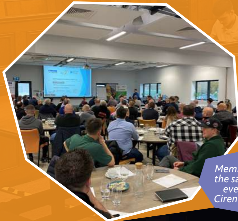
Members at the safe Dig event in Cirencester.

Our Safe Dig Event which was part of our STOP MAKE A CHANGE CAMPAIGN saw over 130 people in attendance. Delegates heard about cultures of good practice, new technology and were able to view demonstrations on VAC EX and Ground Penetration Radar.