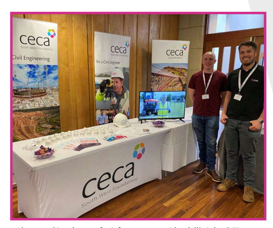
Above: making the case for infrastructure at Blundell's School, Tiverton. Below: with Ben Collins (aka 'The Stig') at Blundell's School