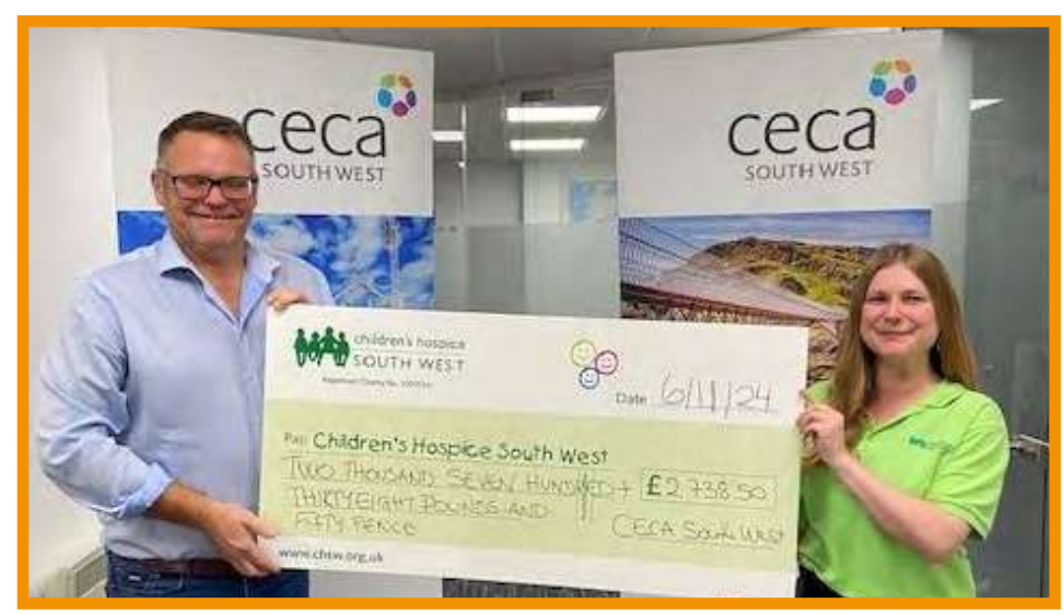
Above: Another whopping £2,738 raised by CECA SW members at our Annual Lunch and Young Achievers' Awards event, which took place in October