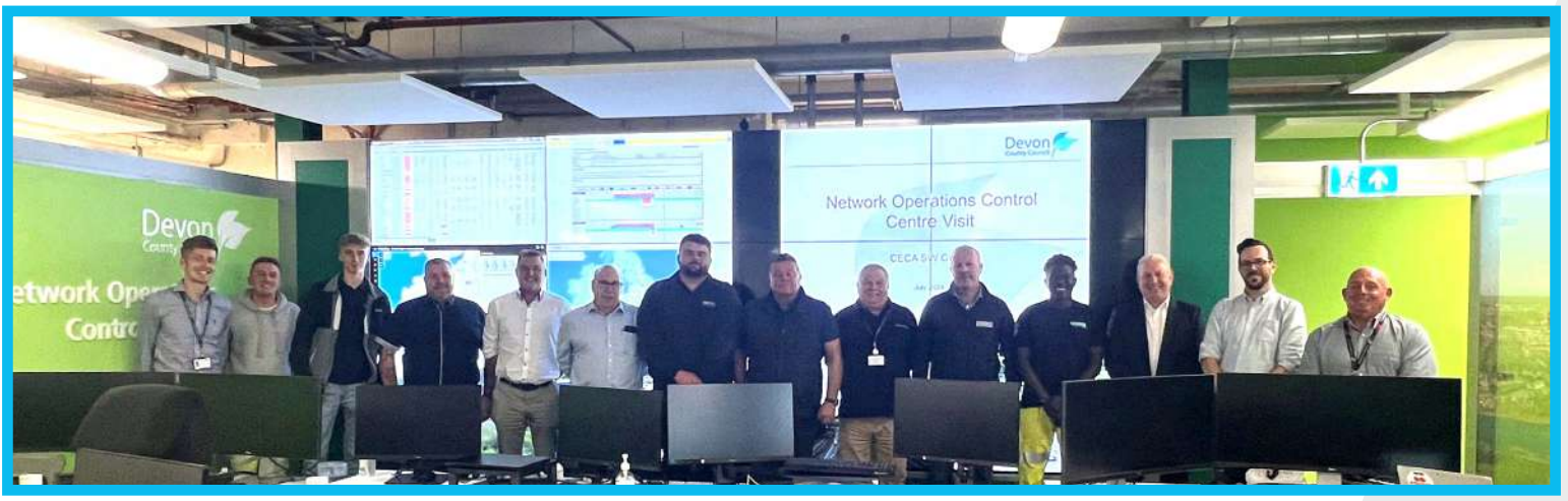
CECA SW members visited Devon County Council's Network Operations Control Centre in Exeter in July