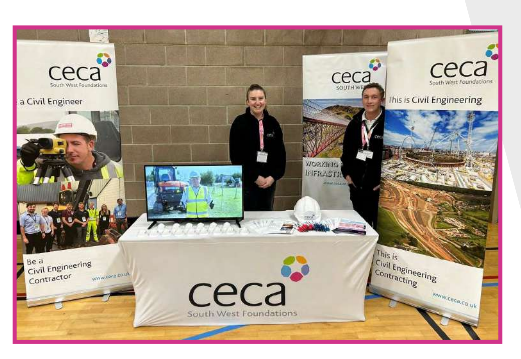
Above: CECA SWFG members prep for the day at Spires College, Torquay