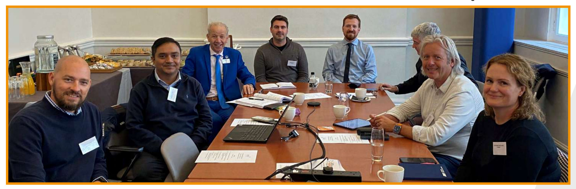
Above: CECA South West hosts the CECA Flood & Marine Group, which meets every quarter