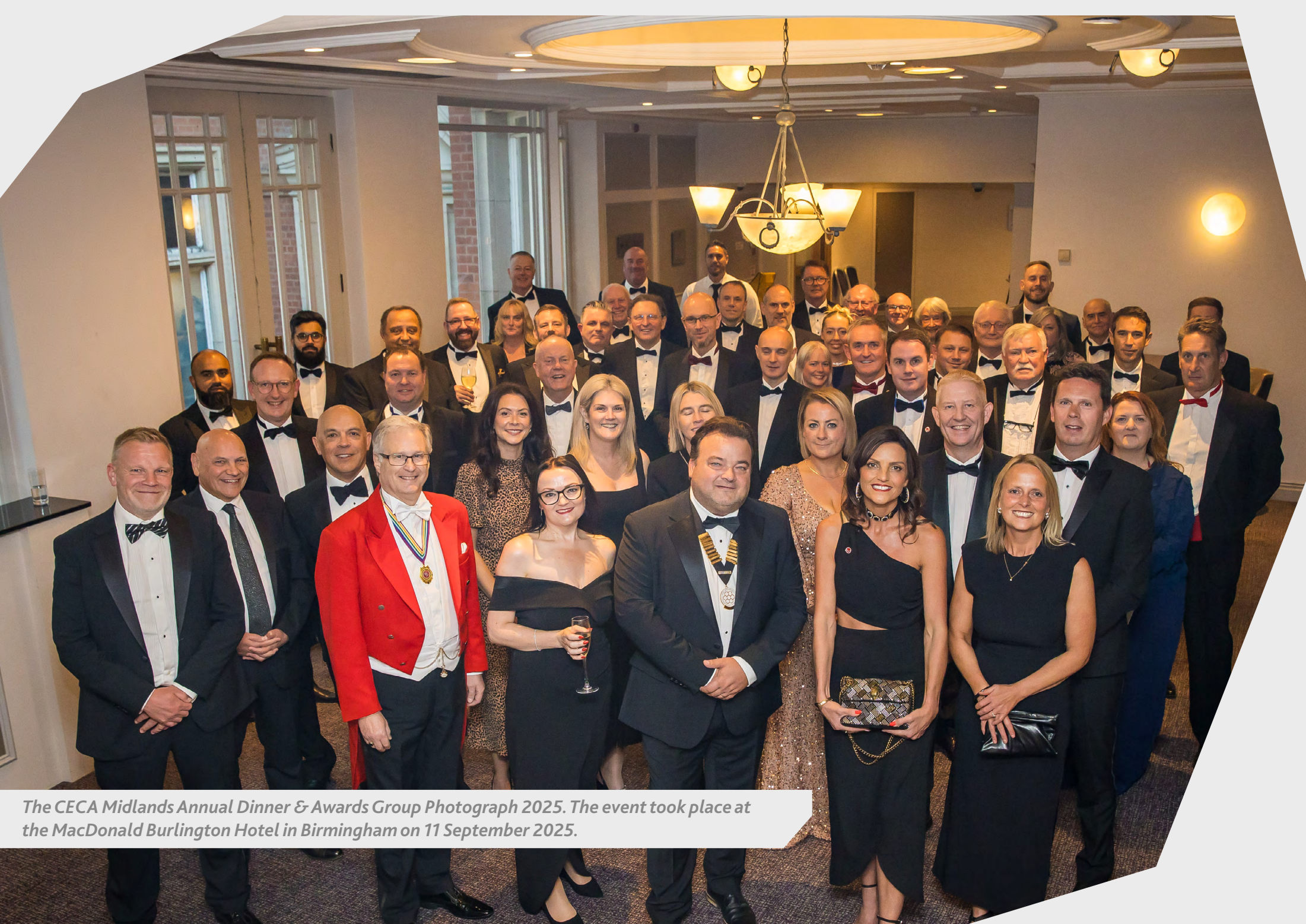
The CECA Midlands Annual Dinner & Awards Group Photograph 2025. The event took place at the MacDonald Burlington Hotel in Birmingham on 11 September 2025.